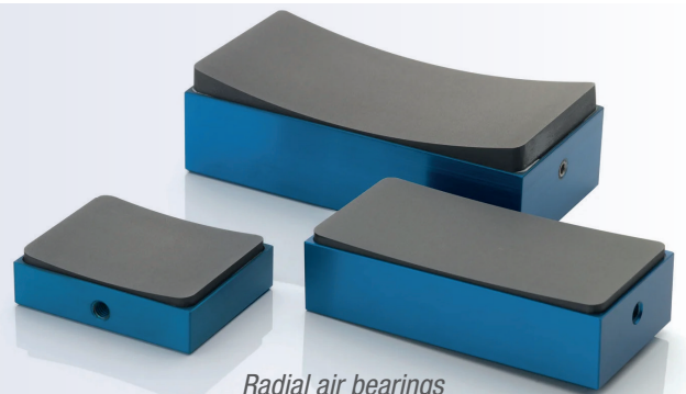
Radial air bearings